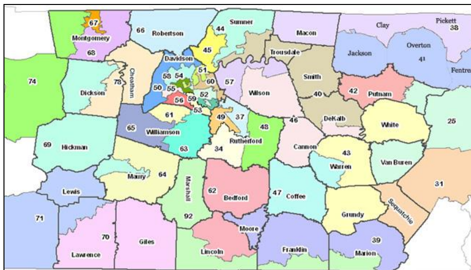
Tennessee General Assembly – Middle Region House Districts