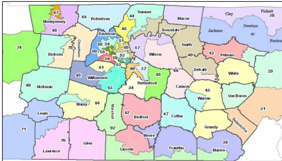
Tennessee General Assembly – Middle Region House Districts